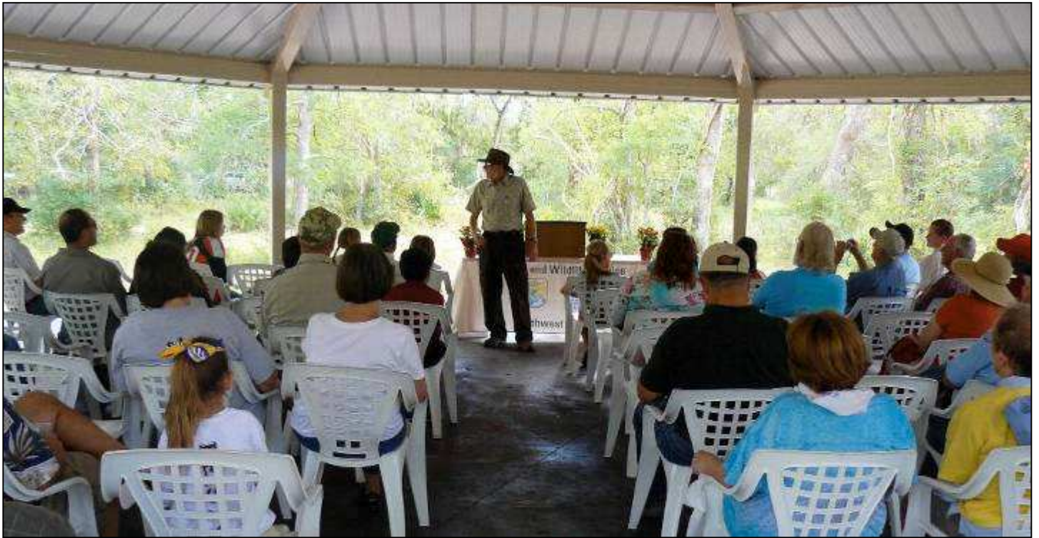
Bryan Adams warms up the audience