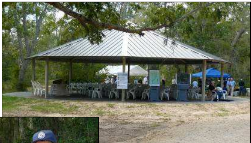
Pavilion, set up for the Celebration

I've kept that space open all morning just for you