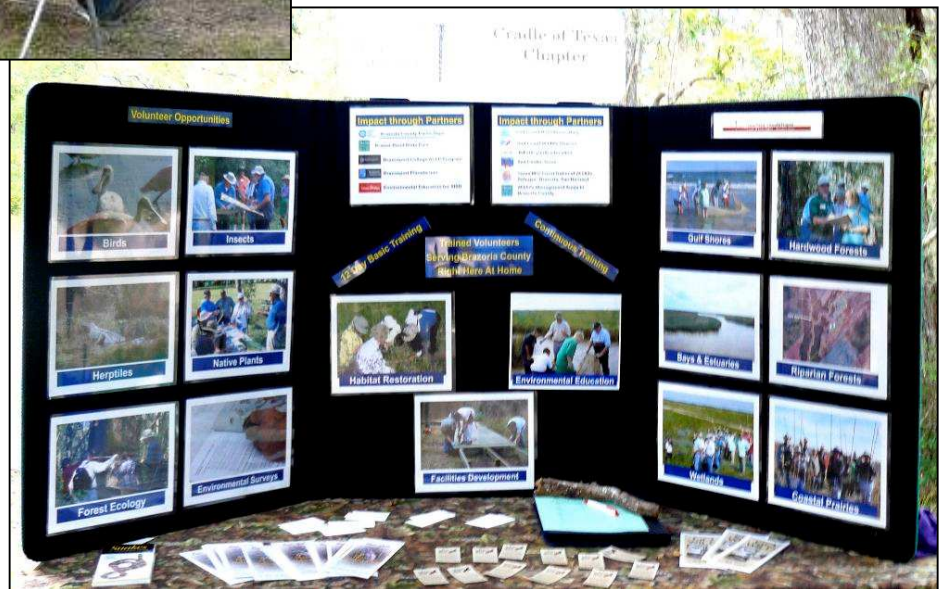
TMN-COT Display Board