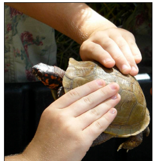
"Hold it like a hamburger!"