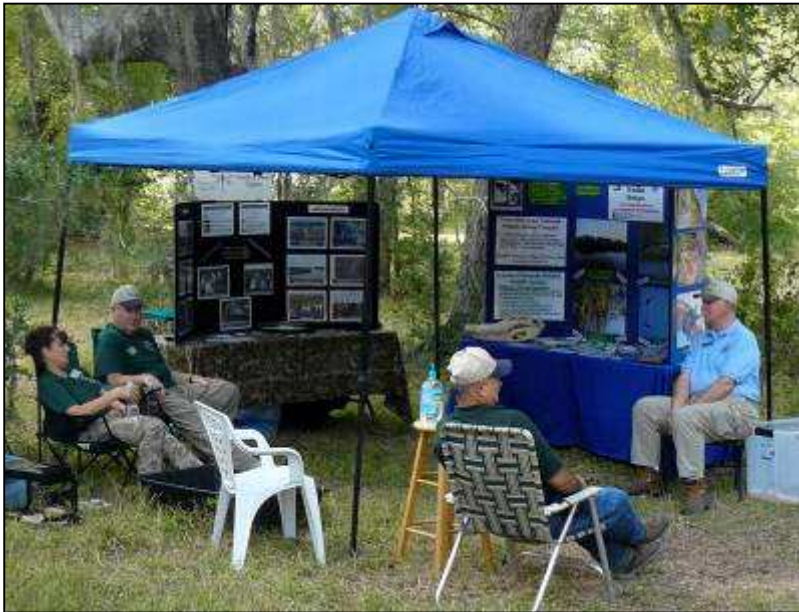
Display tent, before the crowd arrived