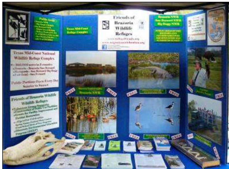
FOBWR Display Board